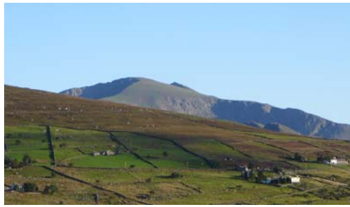
Snowdon seen from Trosgol